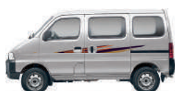
Metallic Silky Silver