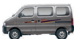
Metallic Glistening Grey