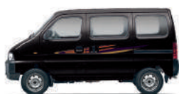
Pearl Midnight Black